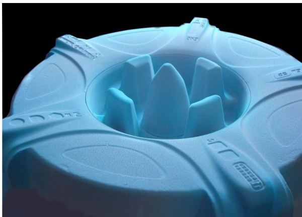
Excellent results in wheel casting

Nanocomp MM provides a protective ceramic layer on the roughness of the insulating base coating. In that way it improves the robustness of the entire coating system. Service time of coating can be improved by factor 3 or more.